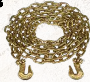
3/8x20FT GR70 CHAIN w/ CLEVIS GRAB HOOKS