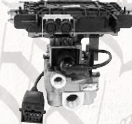
4005001010 WABCO 2S/1M ABS VALVE (no core required)