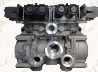
4005001030 WABCO 4S/2M ABS VALVE (no core required)