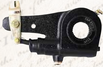
MERITOR STYLE SLACK ADJUSTER 5.5 OR 6" CENTER